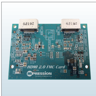
HDMI 2.0 Interface Card FMC Version

* Mpression HDMI interface cards are also on sale. For more information, please contact Macnica's sales department.